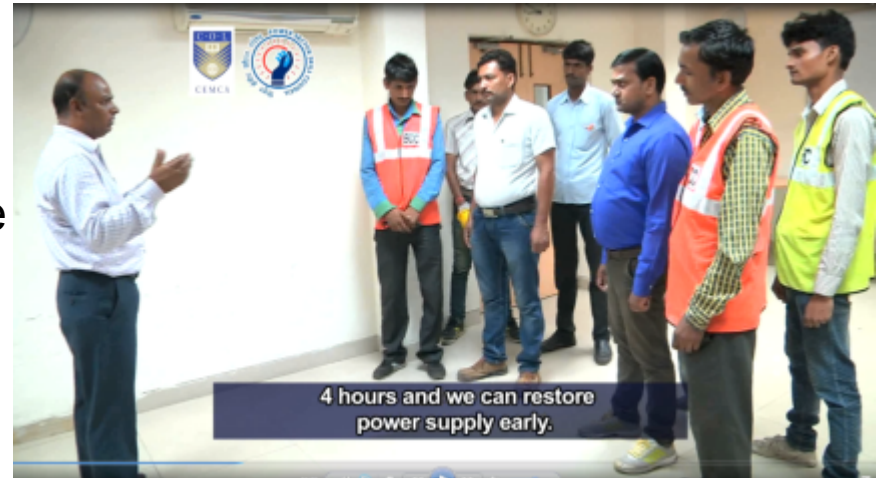
Second Video – Good Teamwork